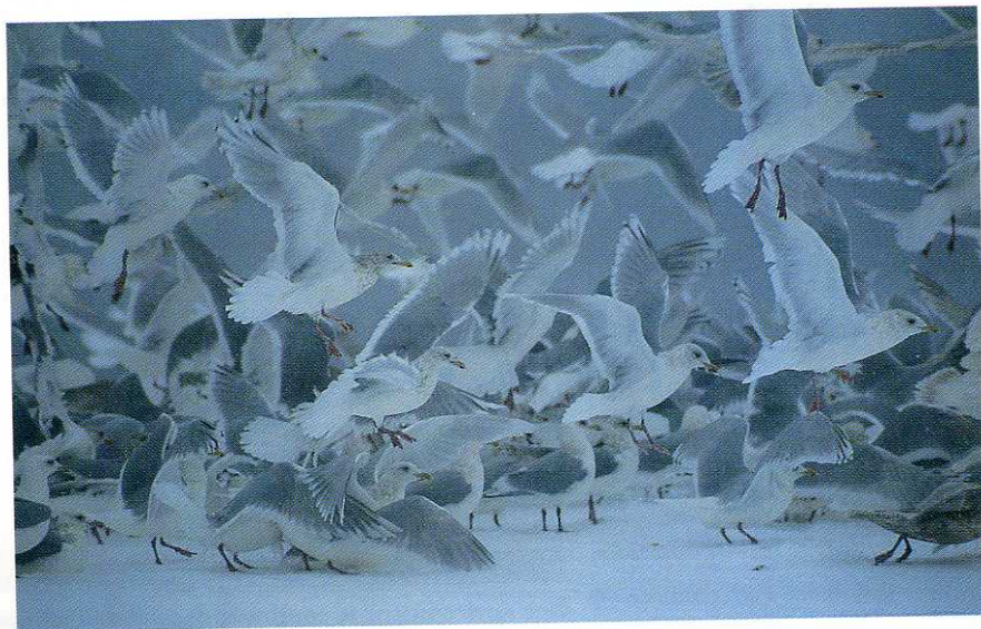
Photo 1. A flock of Kumlien's Gulls at St. John's.