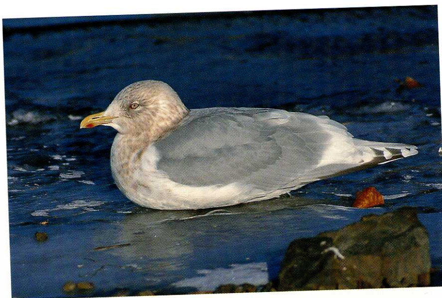
Photo 2. Adult Kumlien's Gull with medium-grey wingtip markings, Stage 4 primary pattern (P5-P10 scores = 0-3-5-5-2-1), and eye score of 2.5 to 3.0. St. John's, Newfoundland, 23 December 1999.

For the darkness of the grey pattern on the wingtip, we used six gradations from white to blackish grey, as follows: 0 – white (Kodak 0); 1 – pale grey, similar in shade to upperparts and primary bases (Estimated Kodak 3-4); 1.5 – medium-